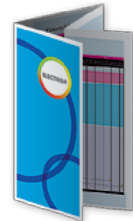
Double parallel Fold