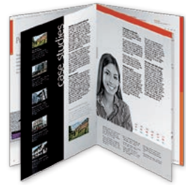
Saddle Stitching and Trimming