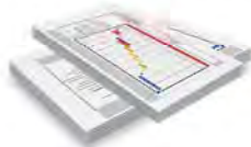
Group & collate