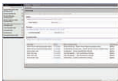
iWMC Main portal

Using Canon's optional e-Maintenance system, device problems can be automatically reported, so there's no need to worry about constant monitoring.