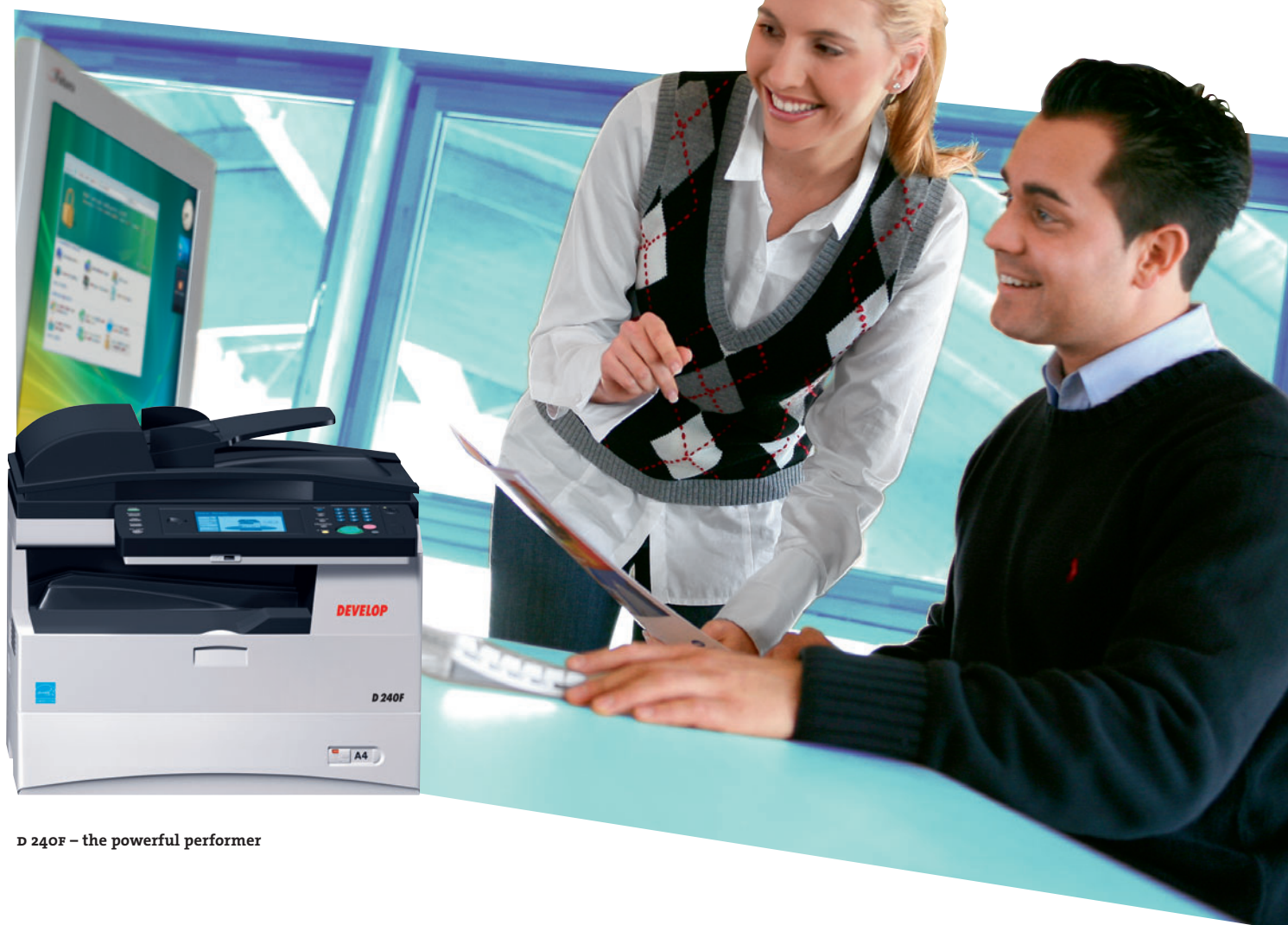
D 240F – the powerful performer