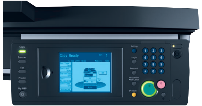
D 240F Touch-Screen-Display, easy to use and functional.

Small offices or departments often have difficulties finding the right office system. Space is limited, the monthly printing volume not particularly high and financial resources limited. Little is printed in colour and documents do not need finishing functions such as punching or stapling. The favourable solution would have a small footprint, work fast and deal with all the routine forms of office communication.