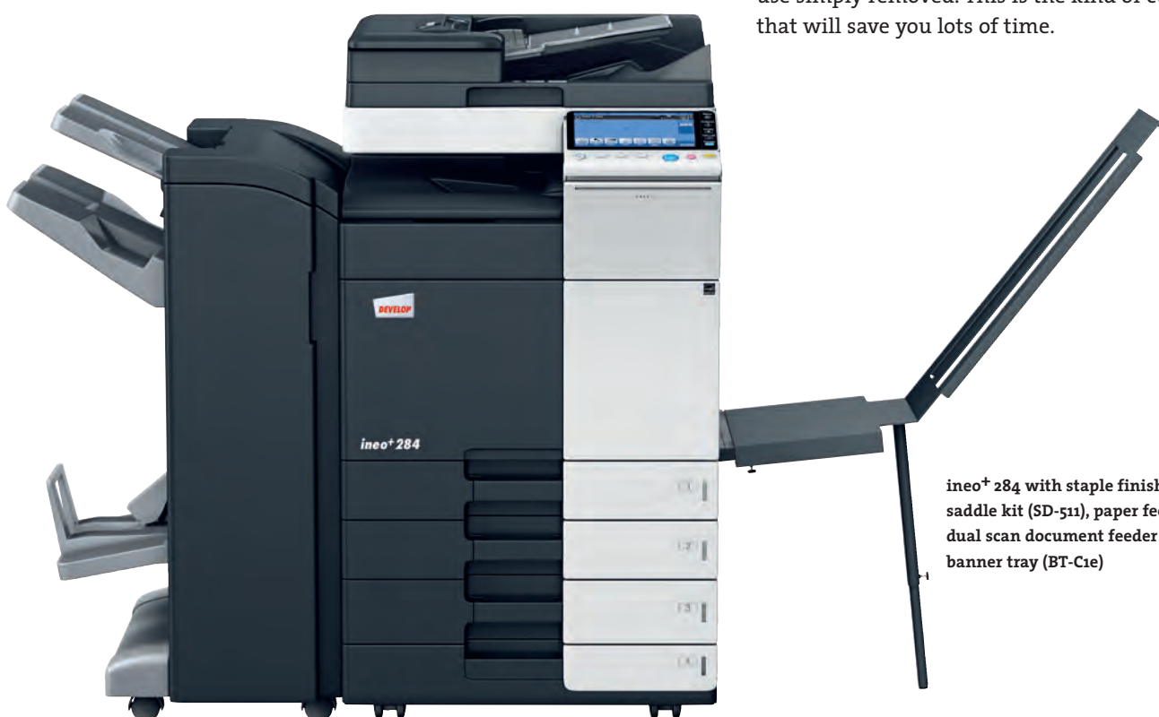
ineo+ 284 with staple finisher (FS-534), saddle kit (SD-511), paper feeder (PC-210), dual scan document feeder (DF-701), banner tray (BT-C1e)

Many multifunctional office systems are anything but user-friendly. The ineo+ 284, in contrast, is simplicity itself. An intuitive, easily understandable operating concept ensures that it is as easy to use as your smartphone or tablet. The 9-inch capacitive touchscreen comes with well-known functions such as flick&drag, and thanks to a new menu navigation structure you can see all functions in one go and select the settings you want with just a few clicks. Frequently used functions can be left on the start screen and ones you don't use simply removed. This is the kind of customisation that will save you lots of time.