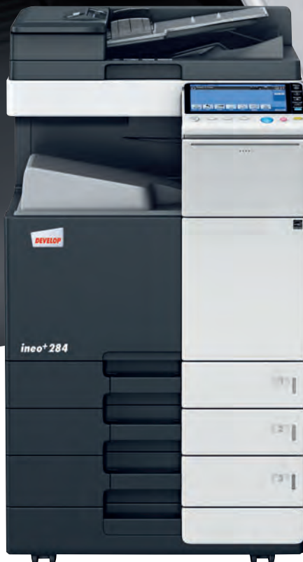
ineo+ 284 with paper feeder (PC-110) and dual scan document feeder (DF-701)