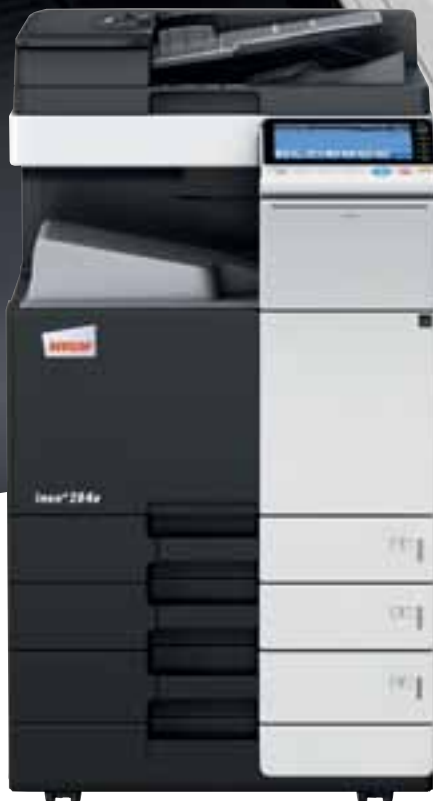
ineo+ 284e with paper feeder (PC-210) and dual scan document feeder (DF-701)