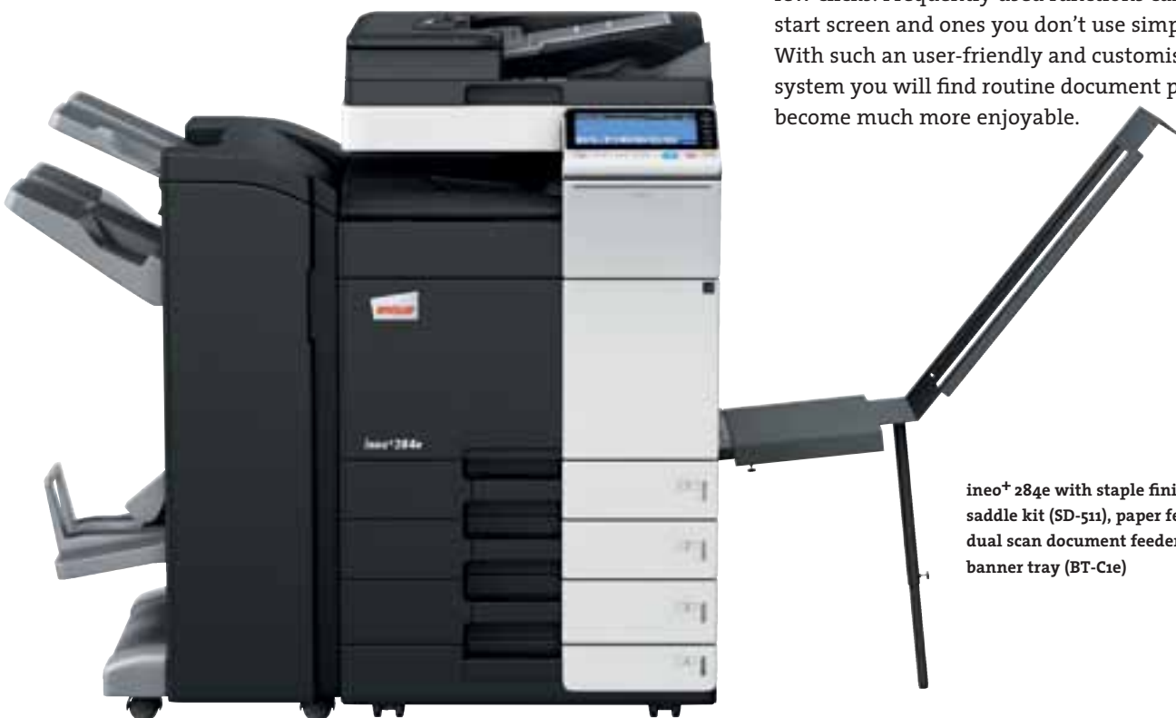
ineo+ 284e with staple finisher (FS-534), saddle kit (SD-511), paper feeder (PC-210), dual scan document feeder (DF-701), banner tray (BT-C1e)

Many multifunctional office systems are anything but user-friendly. The ineo+ 284e, in contrast, is simplicity itself. An intuitive, easily understandable operating concept ensures that it is as easy to use as your smartphone or tablet. The 9-inch capacitive touchscreen comes with familiar multi-touch operations such as flick, drag&drop and pinch in&out – so you will feel at home in this system in no time at all. Thanks to a new menu navigation structure you can see all functions in one go and select the settings you want with just a few clicks. Frequently used functions can be left on the start screen and ones you don't use simply removed. With such a user-friendly and customisable office system you will find routine document production jobs become much more enjoyable.