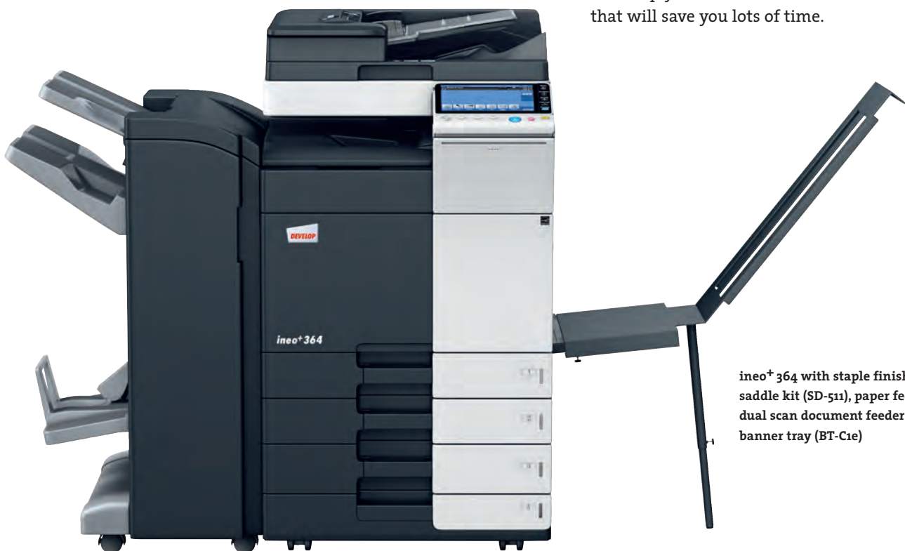
ineo+ 364 with staple finisher (FS-534), saddle kit (SD-511), paper feeder (PC-210), dual scan document feeder (DF-701), banner tray (BT-C1e)

Many multifunctional office systems are anything but user-friendly. The ineo+ 364, in contrast, is simplicity itself. An intuitive, easily understandable operating concept ensures that it is as easy to use as your smartphone or tablet. The 9-inch capacitive touchscreen comes with well-known functions such as flick&drag, and thanks to a new menu navigation structure you can see all functions in one go and select the settings you want with just a few clicks. Frequently used functions can be left on the start screen and ones you don't use simply removed. This is the kind of customisation that will save you lots of time.