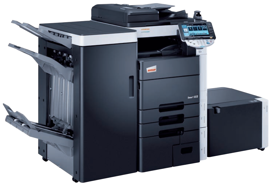
ineo+ 552 with output tray (OT-503)