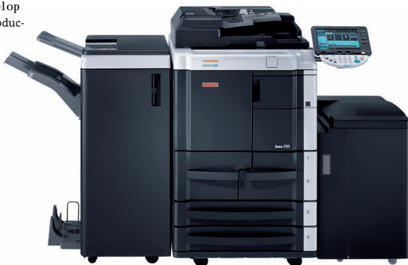
ineo 751 with booklet finisher FS-610, and the large capacity tray LU-405