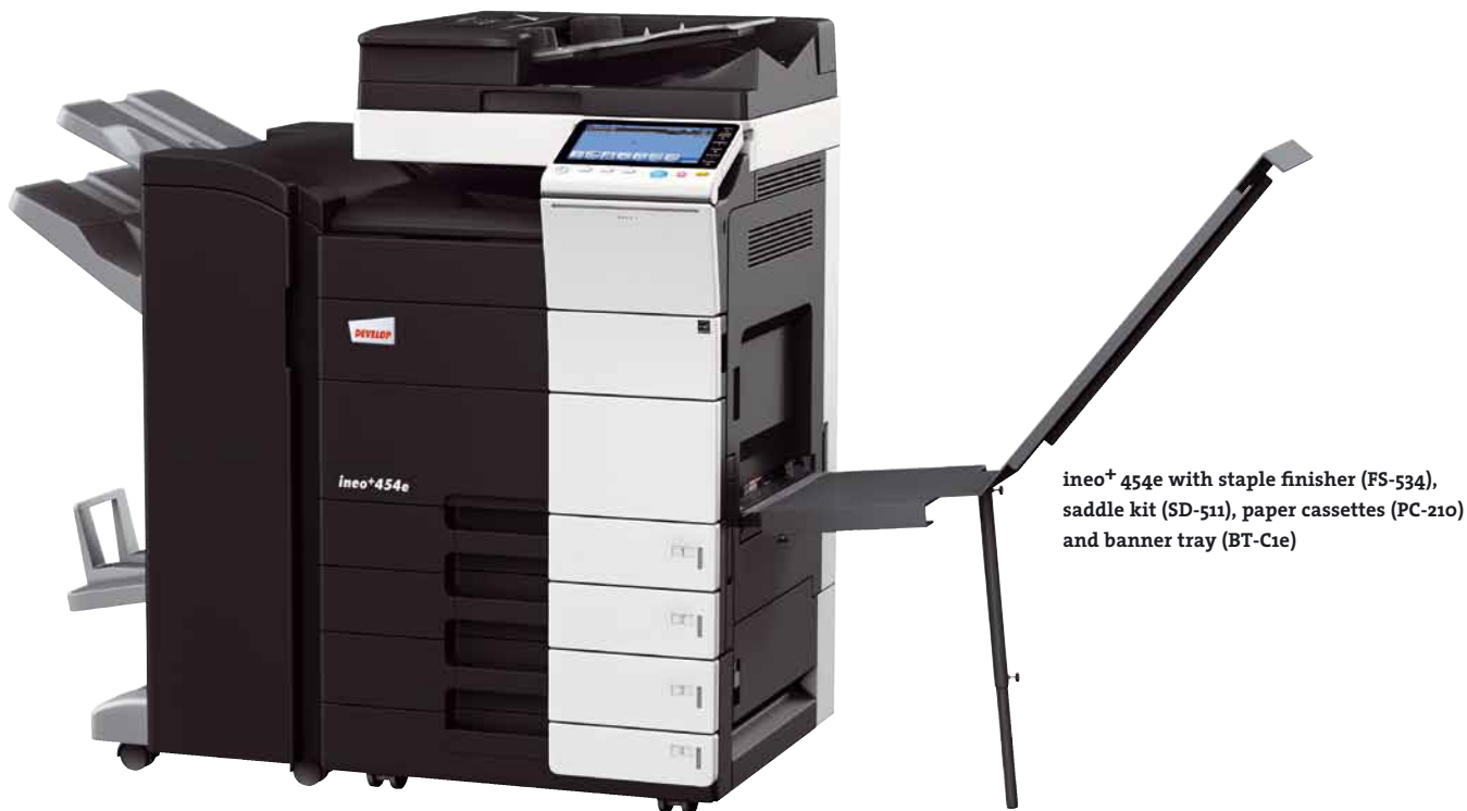
ineo+ 454e with staple finisher (FS-534), saddle kit (SD-511), paper cassettes (PC-210) and banner tray (BT-C1e)