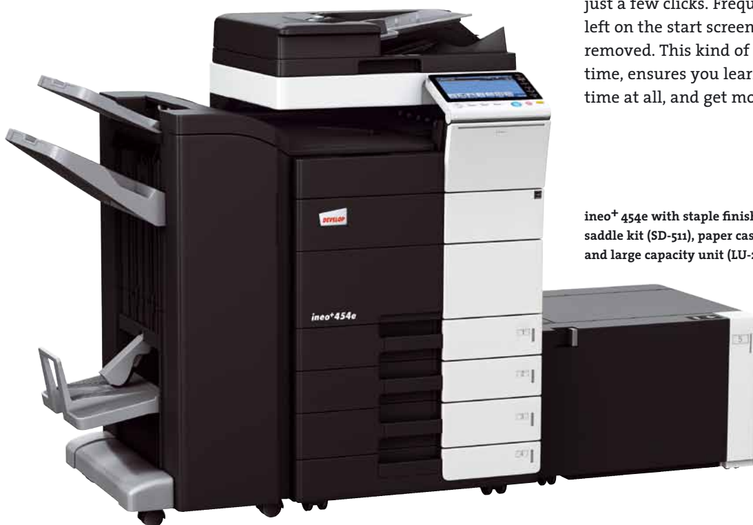
ineo+ 454e with staple finisher (FS-534), saddle kit (SD-511), paper cassettes (PC-210) and large capacity unit (LU-204)

Many multifunctional office systems are anything but user-friendly. The ineo+ 454e, in contrast, is simplicity itself. An intuitive, easily understandable operating concept ensures that it is as easy to use as your smartphone or tablet. The 9-inch capacitive touchscreen comes with well-known multi-touch operations such as flick, drag&drop or pinch in&out. Thanks to a new menu navigation structure you can also see all functions in one go and select the settings you want with just a few clicks. Frequently used functions can be left on the start screen and ones you don't use simply removed. This kind of customisation saves you lots of time, ensures you learn to operate the system in no time at all, and get more fun out of routine office jobs.