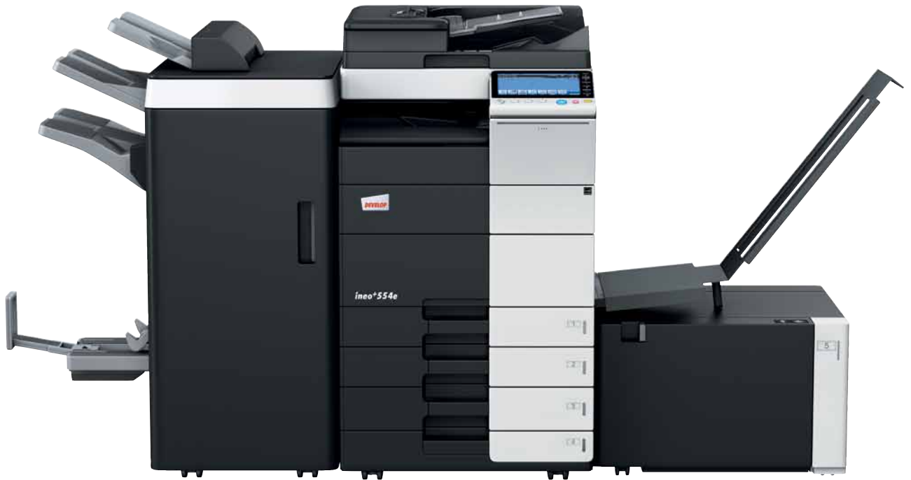
ineo+ 554e with staple finisher (FS-535), saddle kit (SD-512), job separator (JS-602), paper cassette (PC-210), large capacity unit (LU-204) and banner tray (BT-C1e)