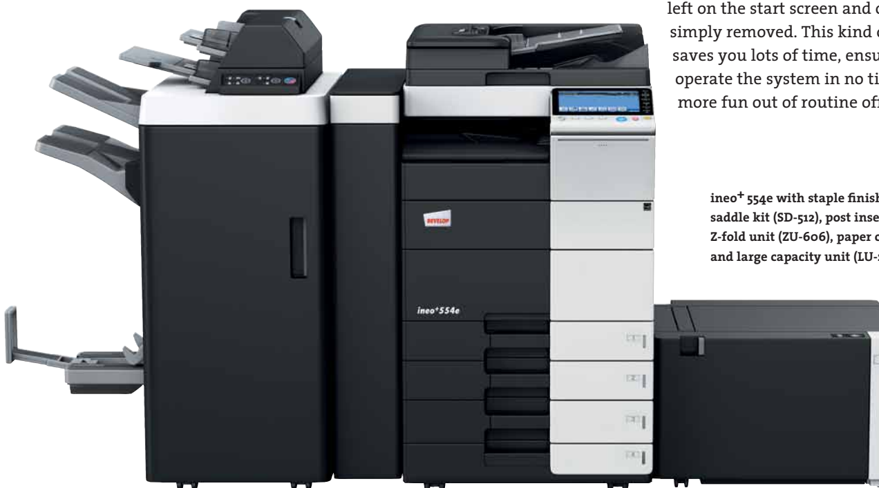
ineo+ 554e with staple finisher (FS-535), saddle kit (SD-512), post inserter (PI-505), Z-fold unit (ZU-606), paper cassettes (PC-210) and large capacity unit (LU-204)

left on the start screen and ones you don't use simply removed. This kind of customisation saves you lots of time, ensures you learn to operate the system in no time at all, and get more fun out of routine office jobs.