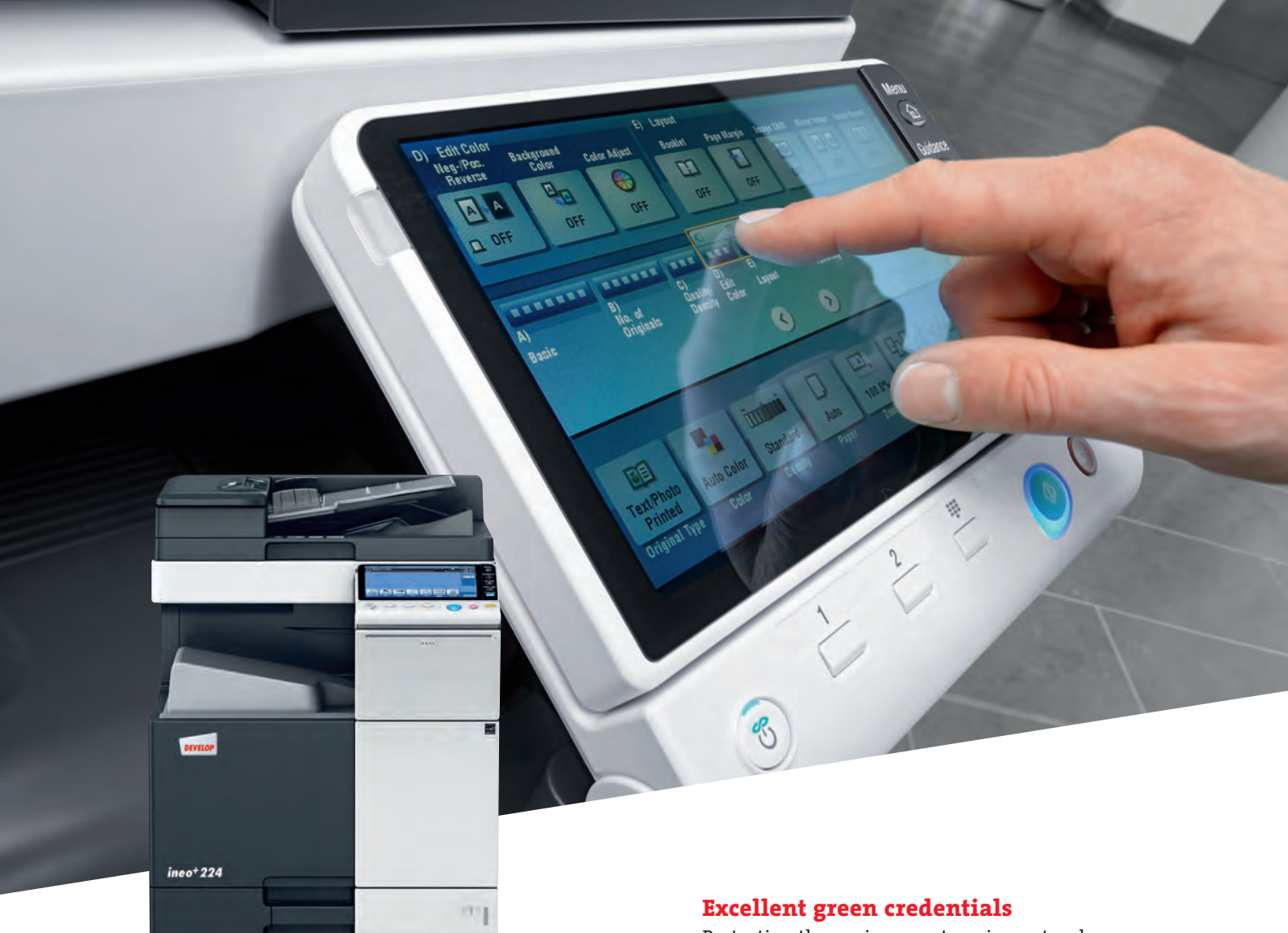
ineo<sup>+</sup> 224 with paper feeder (PC-110) and dual scan document feeder (DF-701)