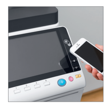
New area for Near Field Communication (NFC) Authentication