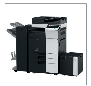
Configuration with FS-534SD Finisher, PC-410 Tray, LU-302 Large Capacity Tray, and DF-704 Document Feeder