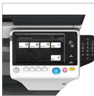
New 7" touch panel with NFC authentication area and optional KP-101 numeric keypad