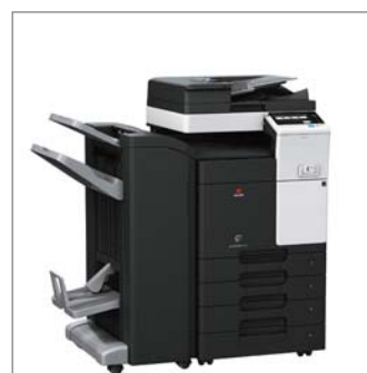
The d-Color MF283 equipped with DF-628 feeder, FS-534SD finisher and PC-214 trays