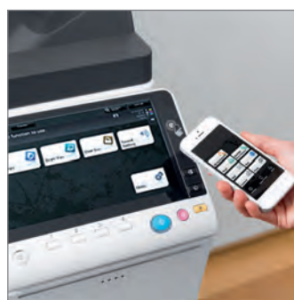
New 10.1" Touch-screen and NFC Authentication Area

The d-Color MF454, d-Color MF554 and d-Color MF654 have a large 10.1" touch-screen with an intuitive user interface designed to be consistent with those used on PCs, tablets and smartphones. The user interface can be customised both visually and practically according to user preferences. In addition, useful "widgets" also can be displayed containing operational notes or warnings.