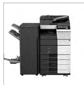
Configuration with SF-537SD Finisher, PI-507 Post-Insertion Unit, RU-513 Connection Unit, PC-215 Drawers, LU-207 Side Drawer

Airprint® functionality, provided as standard, allows printing from iOS devices, Compatibility with Google Cloud Print™ is possible through the installation of a specific software connector and they also support a wide variety of managed print service solutions