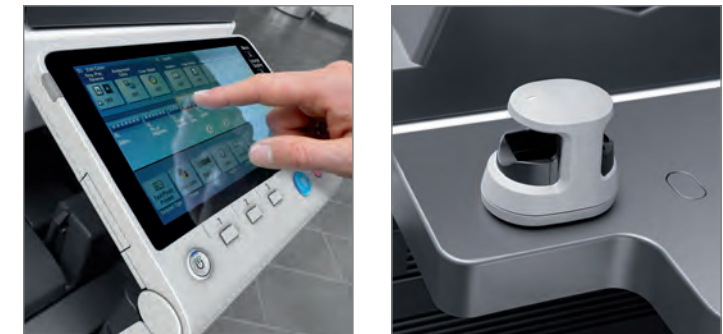
9" multi-touch display with 10-key pad (optional) Advanced security options, multiple authentication systems

Integration with Active Directory or badge-based authentication ensure controlled access to printing and also provide the IT manager with important tools to monitor costs and cut paper and toner waste, for a more sustainable print environment. Secure use and respect for the environment, assisted by low TEC values.