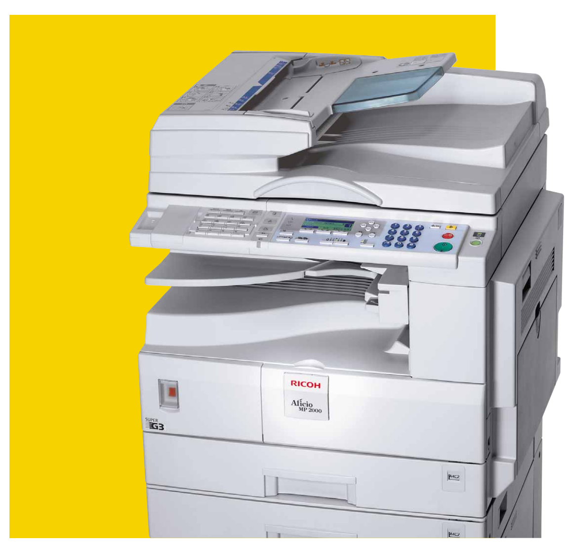
Aficio MP 1600/MP 2000