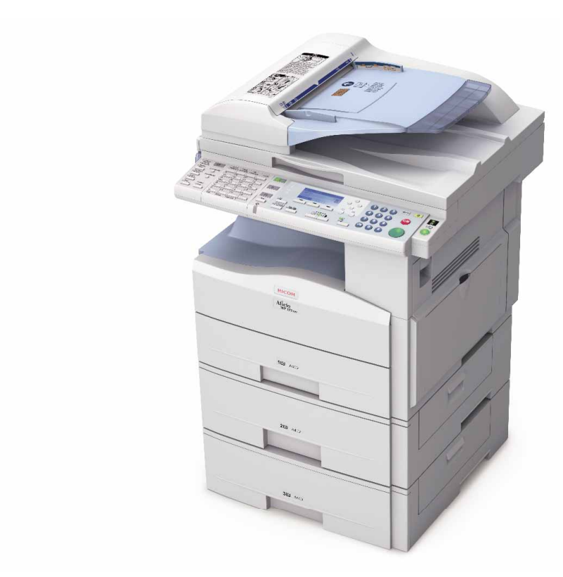
Aficio<sup>™</sup> MP 171/MP 171F/MP 171SPF