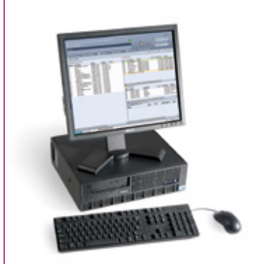
Xerox® FreeFlow® Print Server

Each server is designed to meet a specific set of workflow and application requirements. Your Xerox representative will help you choose the one that best suits your needs.