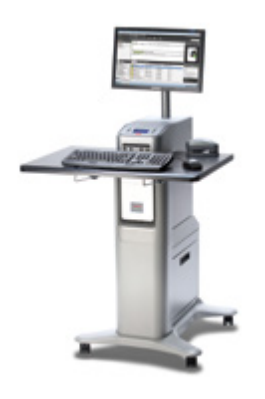
Xerox<sup>®</sup> EX Print Server, Powered by Fiery<sup>®</sup>*